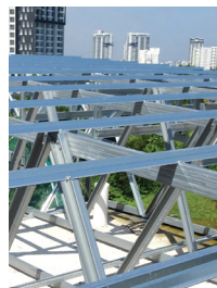
Unmatched corrosion resistance

With three to five times the lifespan for a marginal cost increase, MAGNA-SHIELD PRO™ (MSP) is made for longevity and reliability . It outperforms traditional hot-dip galvanised products in many applications, delivering: