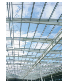
A refined satin matt appearance

At Millform Australia® , we back our expertise with a Statement of Performance , confident in our coating capabilities providing long-term durability. When strength, longevity, and protection matter, MAGNA-SHIELD PRO™ (MSP) is the smart choice.