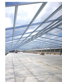
Compatibility with concrete