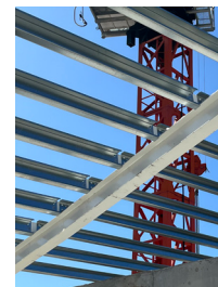
A premium finish without post-galvanising